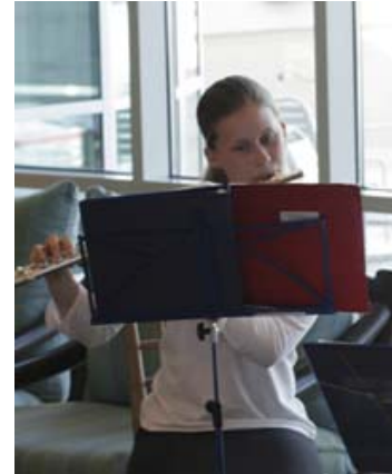
Redwood City School District student members of the Peninsula Youth Orchestra play for guests as they arrive.