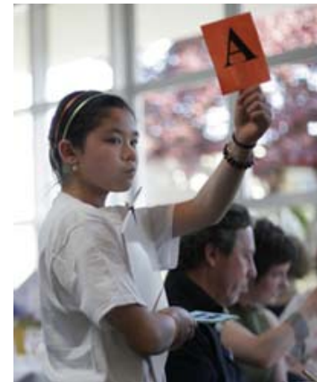
Middle-school students served as team captains during the "Do You Know?" game.