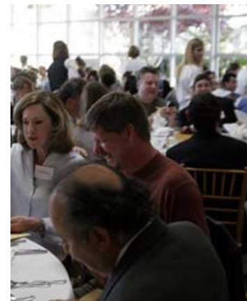
Guests tackled our version of the STAR test with real questions from state tests and bonus education questions.